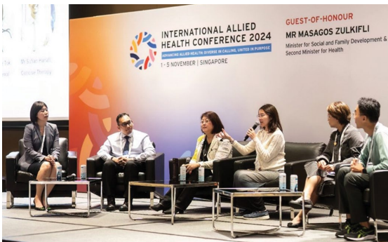
Panelists from the IAHC 2024

Boys' Town had the honour of presenting our mental health initiatives at the recent International Allied Health Conference (IAHC) at the Singapore EXPO from 1 to 2 November 2024. Over 1,100 Allied Health Professionals (AHPs) and industry partners in the field came together to network and witness the launch of the Global Allied Health Network, and shared learnings around the theme of “Advancing Allied Health: Diverse in Calling, United in Purpose”.