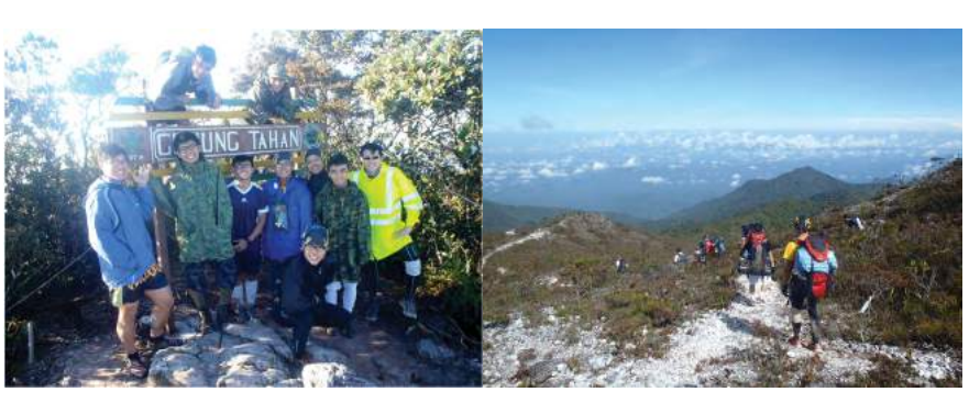
At the cool peak of Gunung Tahan. Hiking down the summit while surrounded by a sea of clouds.

Eight of our boys has conquered Malaysia's highest peak – the 2187 metre-high Mount Gunung Tahan. The group had been training for four months before setting off on their mission on 8 June with two Boys' Town staff and their expedition leader, Mr