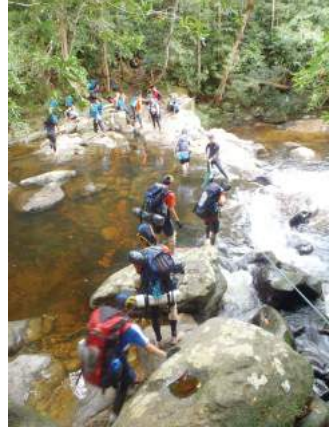
Crossing one of the major rivers at mid-point of the climb.

Eight of our boys has conquered Malaysia's highest peak – the 2187 metre-high Mount Gunung Tahan. The group had been training for four months before setting off on their mission on 8 June with two Boys' Town staff and their expedition leader, Mr