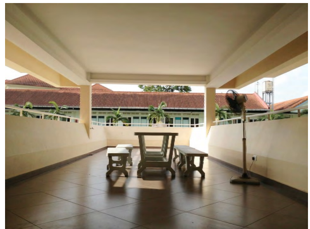
'Chill out' corner for the boys