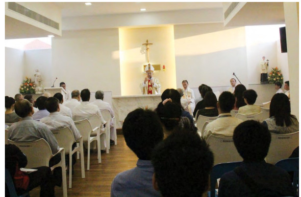
Blessing of our new main building