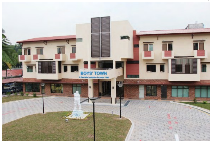
Driveway leading to the new building

New main building completed. A Certificate in Youth Work accredited by Workforce Development Authority (WDA) and Social Service Training Institute (SSTI) was launched.