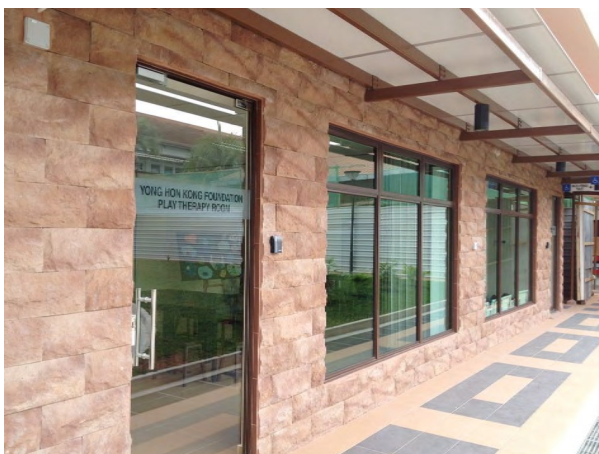
Play therapy room