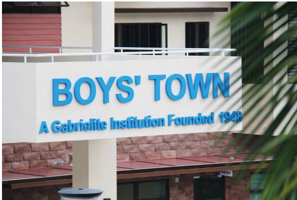
Front of building