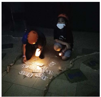
Participants enjoying a camping activity in one of the 'dark rooms'