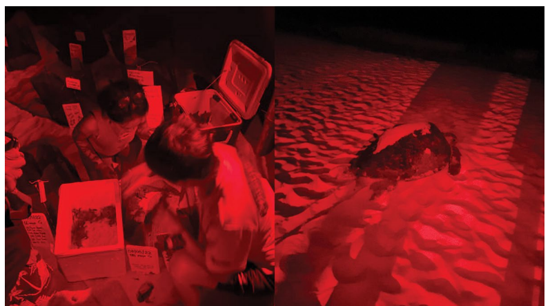
(Left) - Data collection during a turtle hatching event.

The most memorable part of my internship was when I was a part of the planning team for Project Mettle for ITE College Central. It was a journey-based Therapeutic Adventure programme designed with the Environmental Charter of Outdoor Education as a key driver of engagement and change. I had the rare opportunity to go to Tioman, Malaysia for an expedition recce. In Tioman, at Juara Turtle Project, I saw the devastation of how a simple fishing line could end generations of turtles. I even got to witness the full circle of a turtle's life! Together with the team, we have learnt that everyone has a part to play in protecting the environment from further damage. Overall, my experience has brought me closer to my goals and I am excited for what the future has to bring!