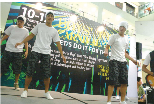
Performance by our Dance & Band Boys